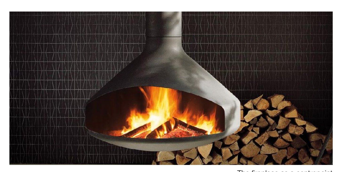
The fireplace as a centrepoint