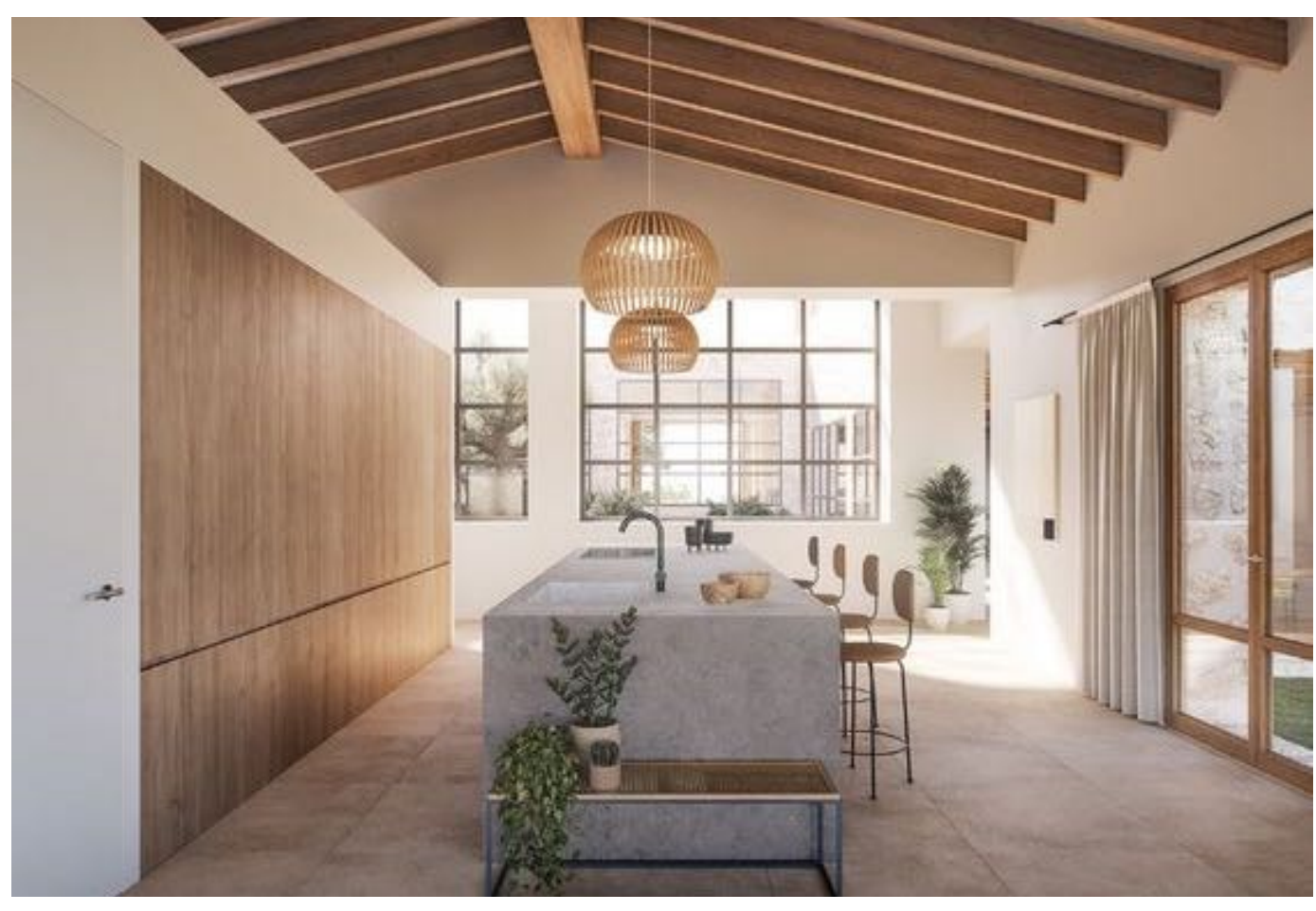
Kitchen with natural materials and a lot of daylight