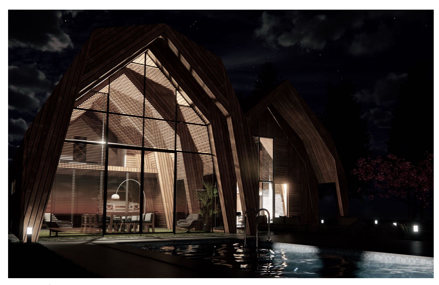
On the landscape side the house opens up to make a full connection with the environtment