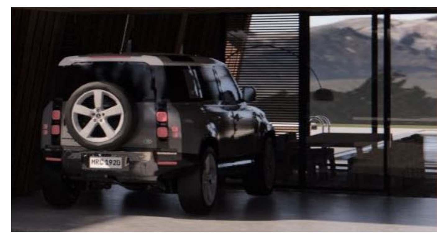
When entering the car garage the landscape reveals itself