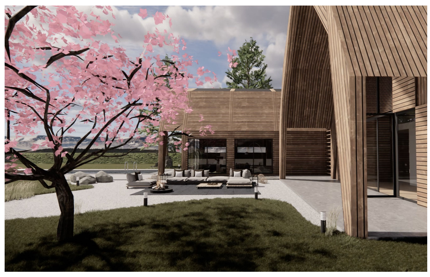
The verandas on the south-west facades offer shading and prevent overheating during summer