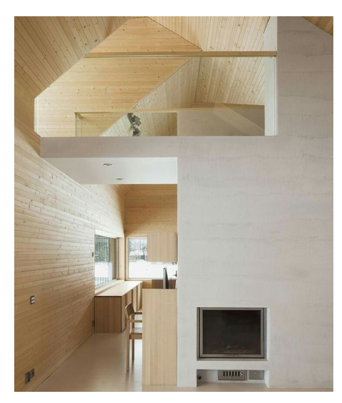
Core mass with fireplace