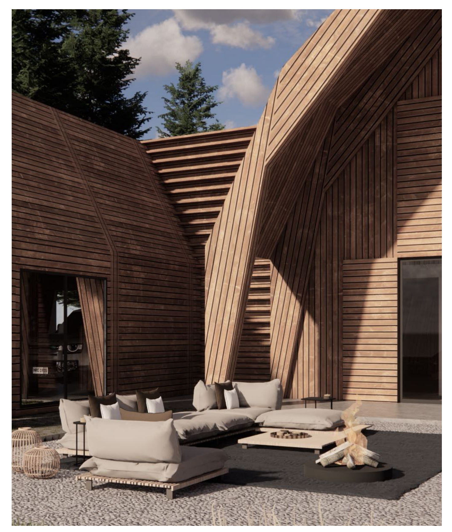
The big outside terrace is perfect for lounging in the summer evening sun