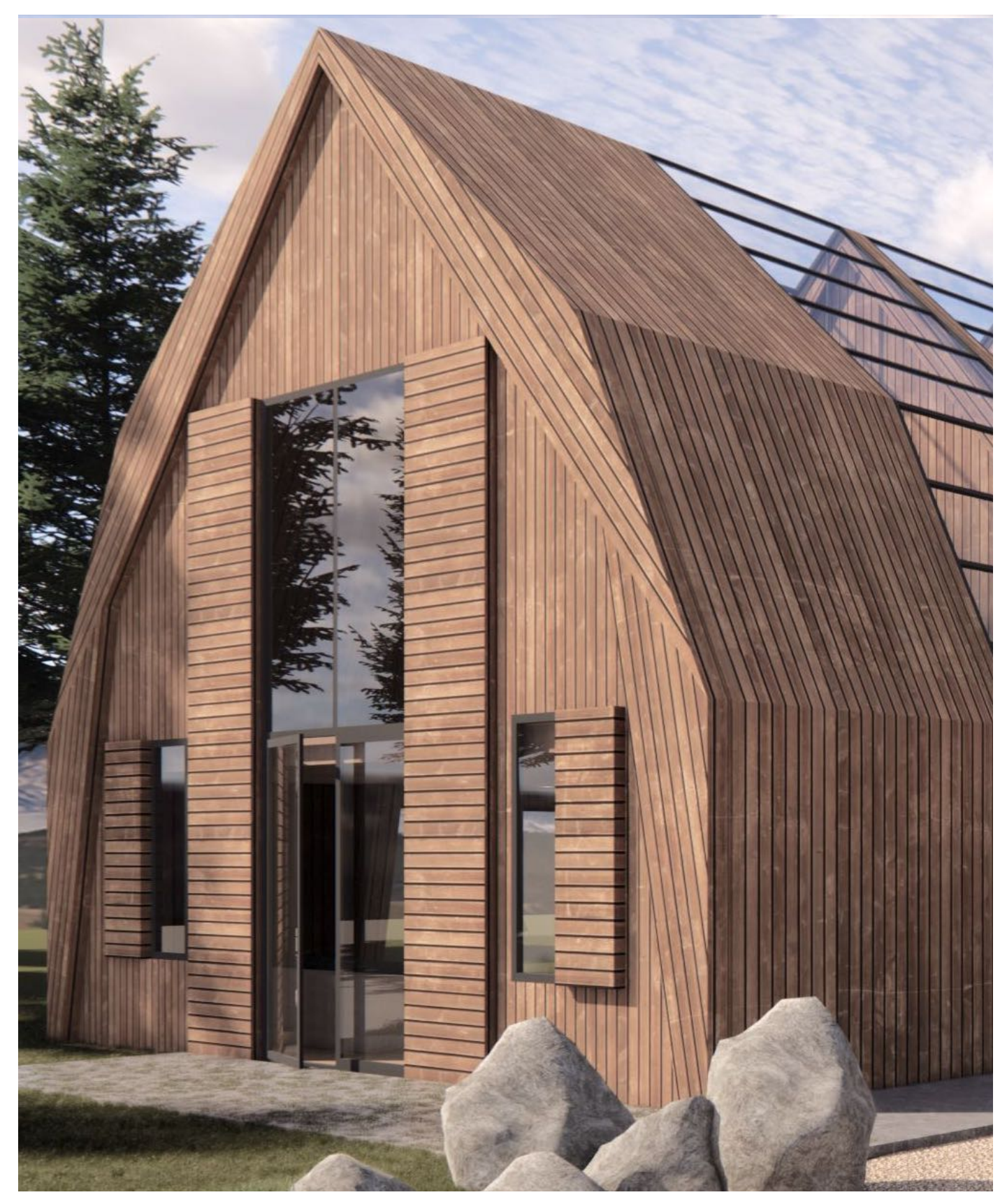
The facade on the entry side is more closed and formal to ensure privacy