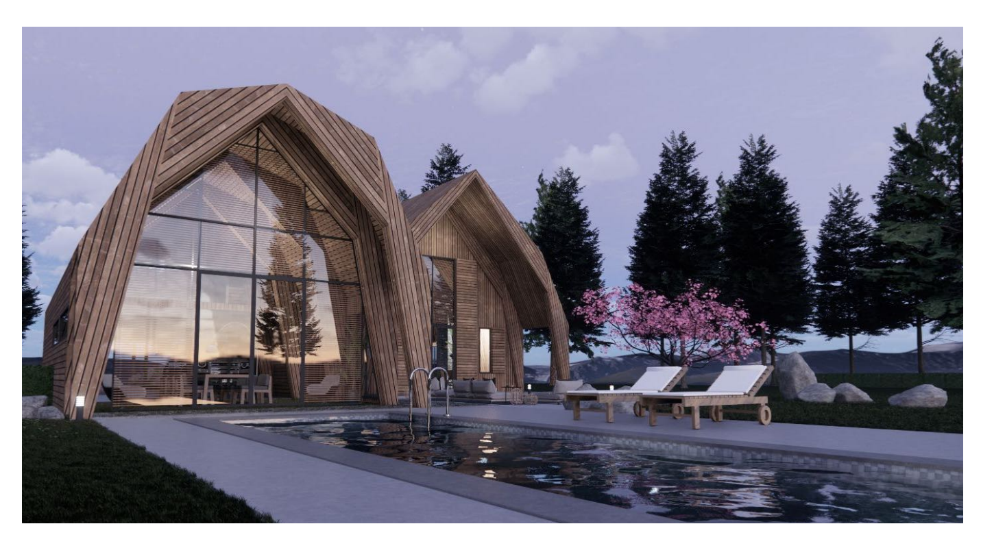
The reflecting pool brings the daylight deep into the house