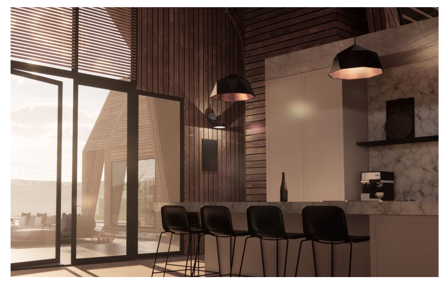
The bar offers an excellent view on the surrouding environment