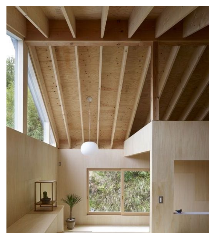
The construction is part of the spatial experience